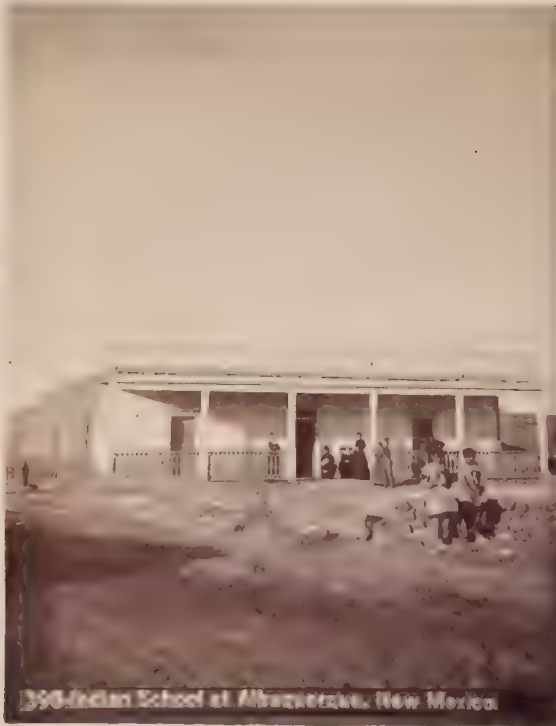
Indian School at Albuquerque, New Mexico